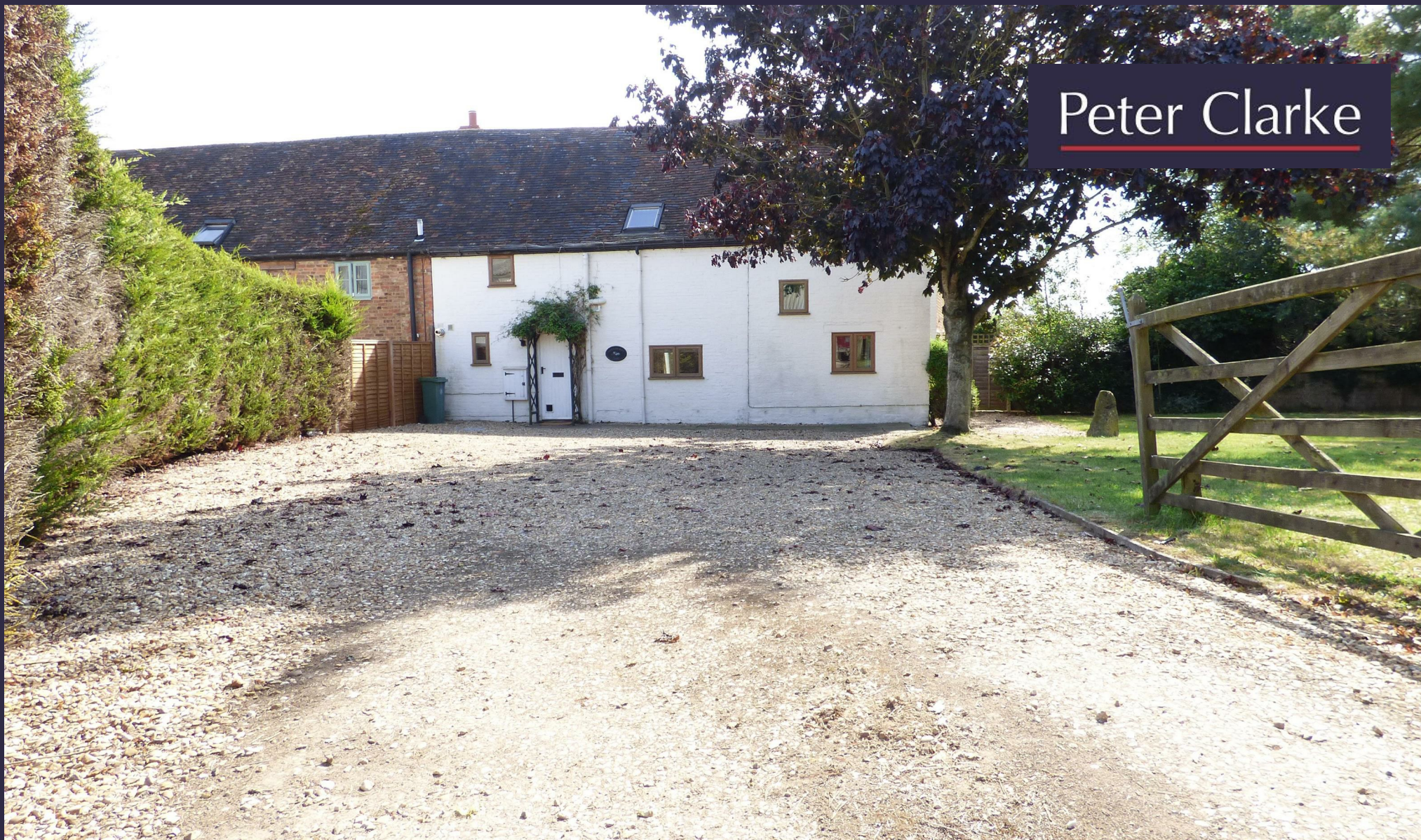
Middlehurst Farmhouse, Campden Road, Shipston-On-Stour, Warwickshire, CV36 4PZ